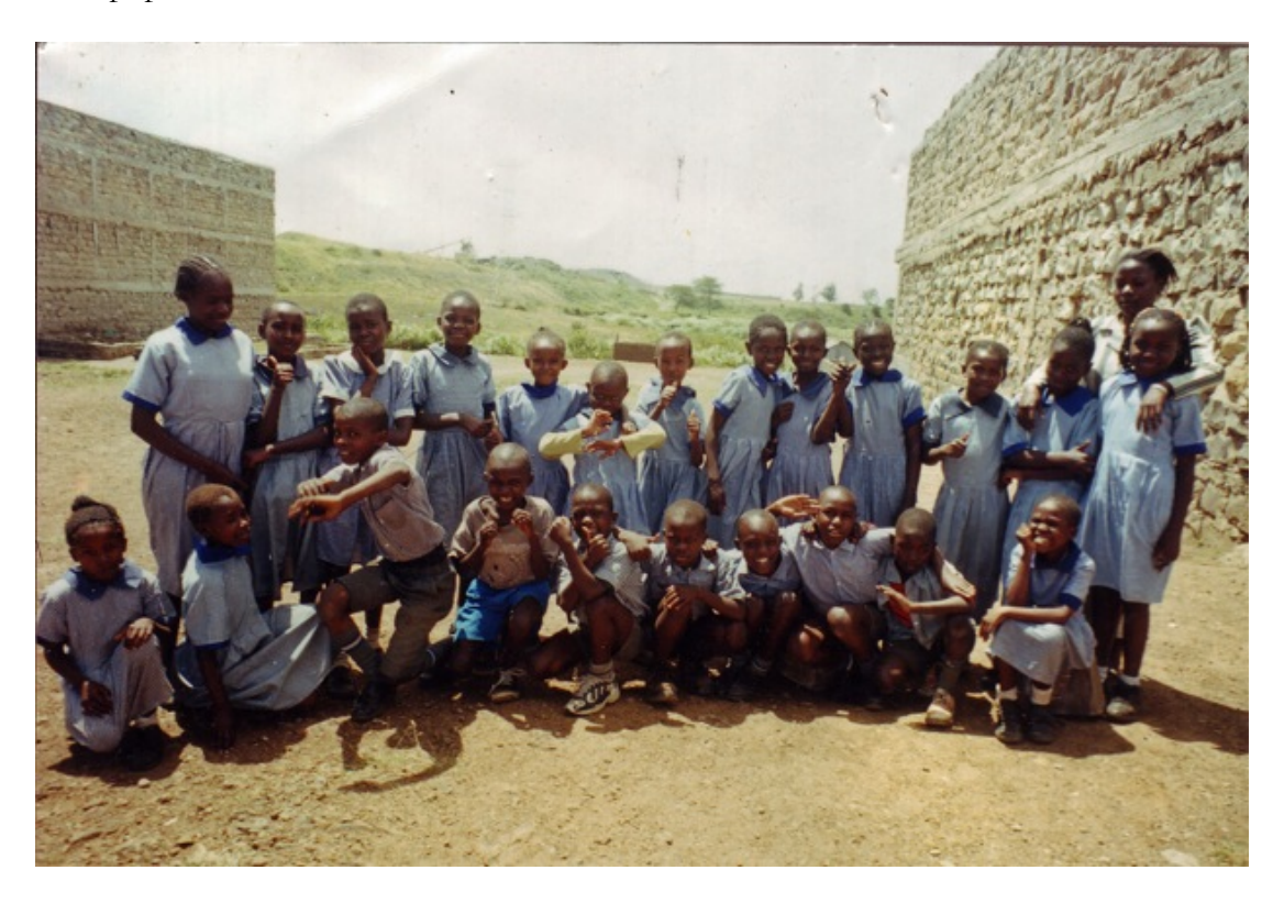
A third class.