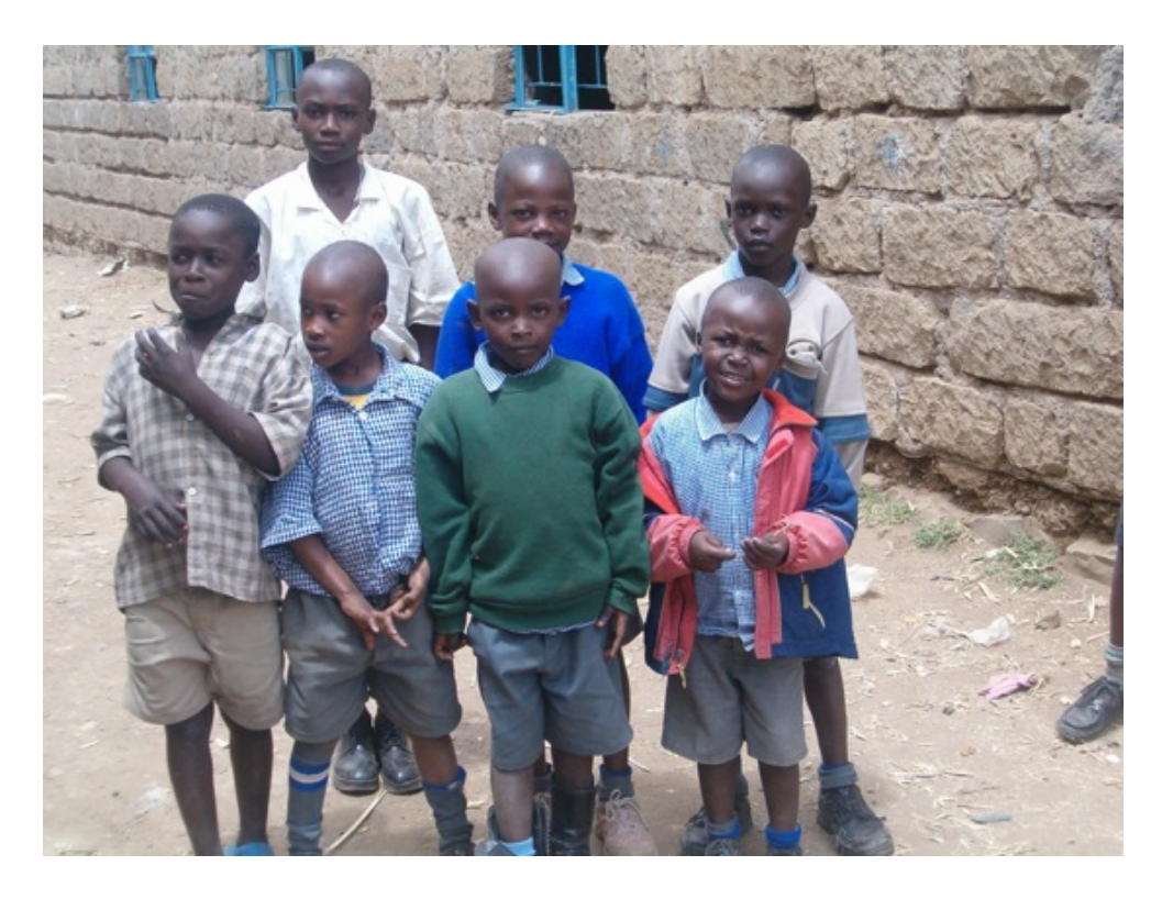
Some of the children taking a pose for a photo during their break.