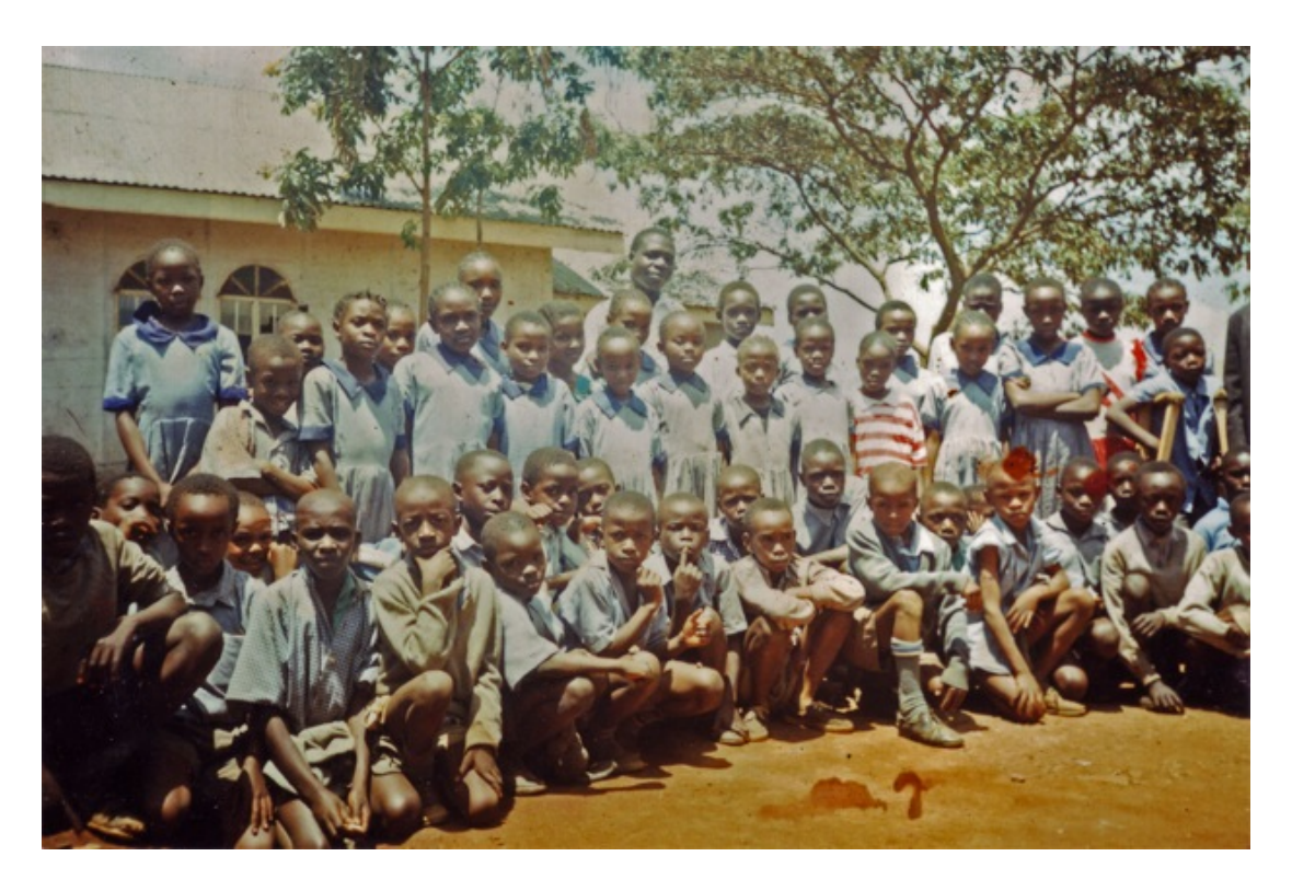
Some of the pupils on a trip within the Soweto slums.