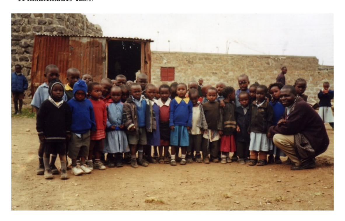
The St. Lazarus nursery school.