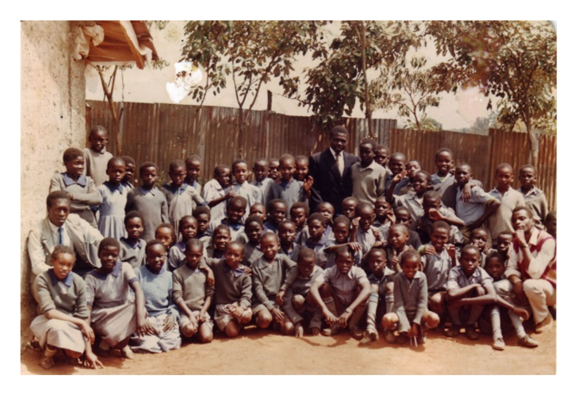
All the pupils behind the school.