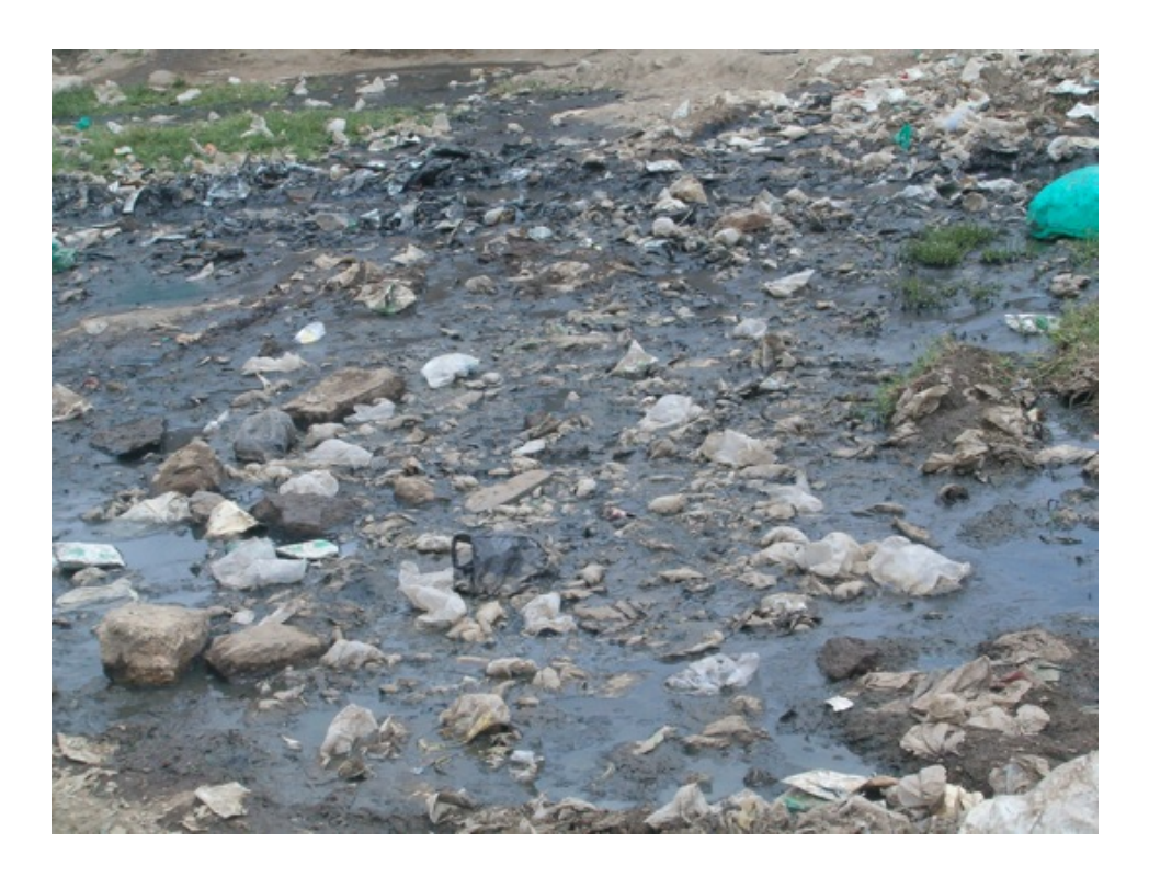
Some of the polluted rivers in the slum posing a health hazard to the community.